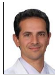
Secretary/Treasurer (& a former Past President)